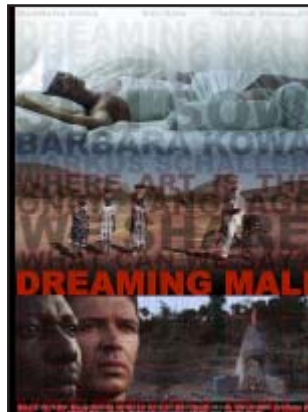
Dreaming Mali