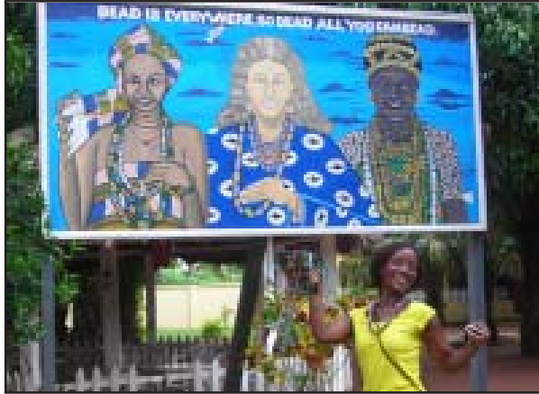
Bead is everywhere, so bead all you can bead!

During my stay in Ghana, I worked for an organization called Women's Assistance and Business Association (WABA). WABA has been providing vocational training courses for women