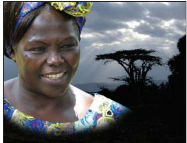
Taking Root Signature Image

Place: Cook Campus Center, Multipurpose Room C